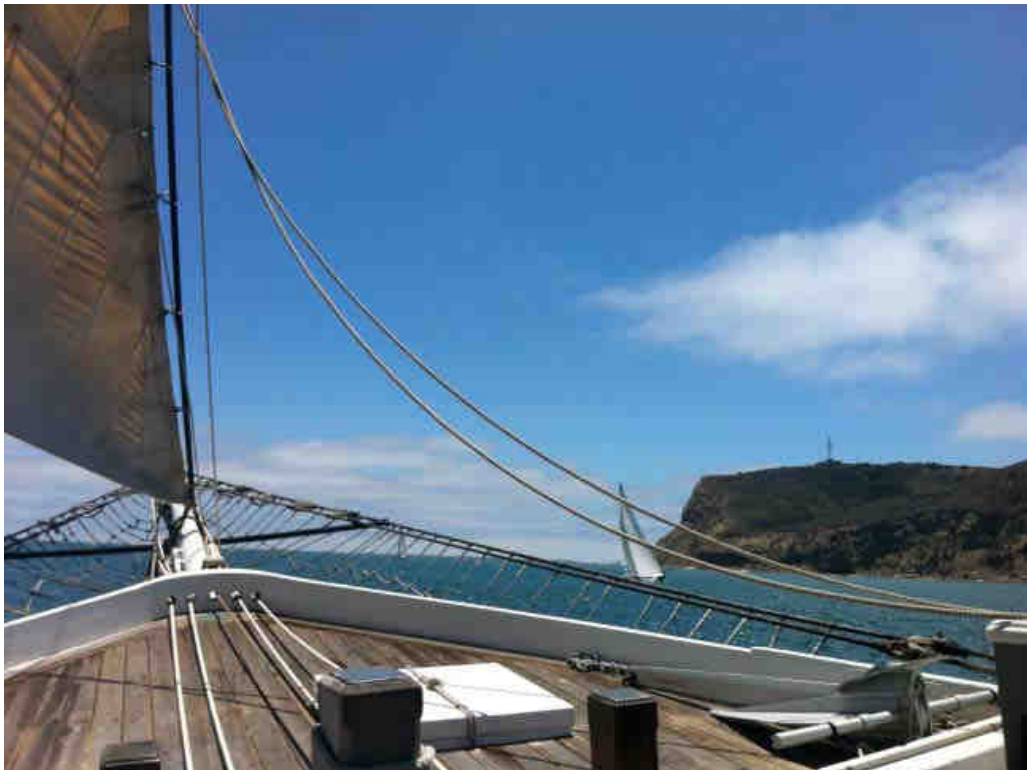
Point Loma from Californian .

The next meeting will be Wednesday, 11 July 2012 aboard the Berkeley at 7:00pm.