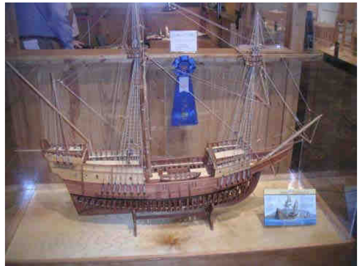
Bombasiro's San Salvador, Ship Model 1st Place