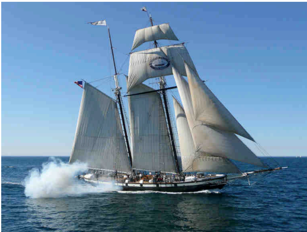
Californian fires a shot during the 2008 November Sail.

The next meeting will be Wednesday, 11 March 2009 aboard the Berkeley at 7:00 pm.